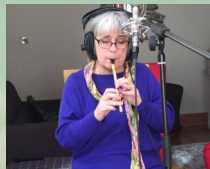
In the Studio